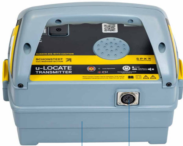
Accessory base tray

High visibility reflective design helps protect operators and equipment